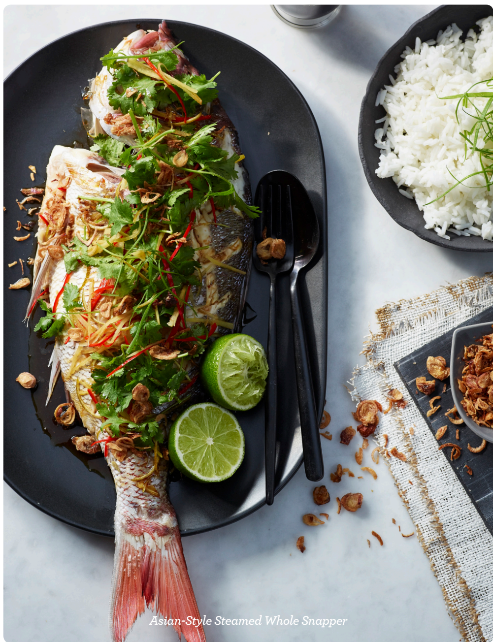
Asian-Style Steamed Whole Snapper