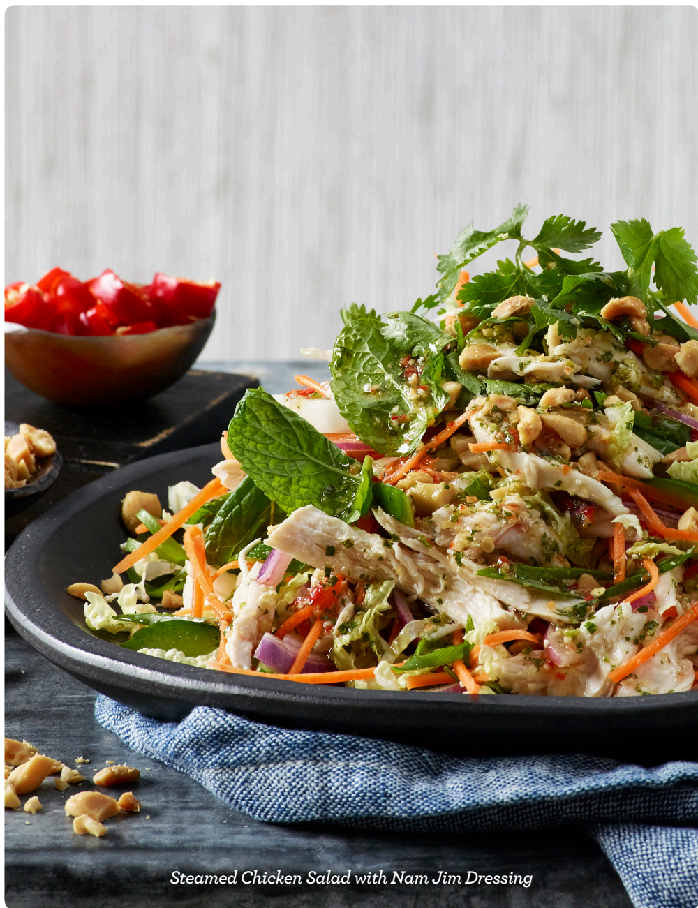
Steamed Chicken Salad with Nam Jim Dressing