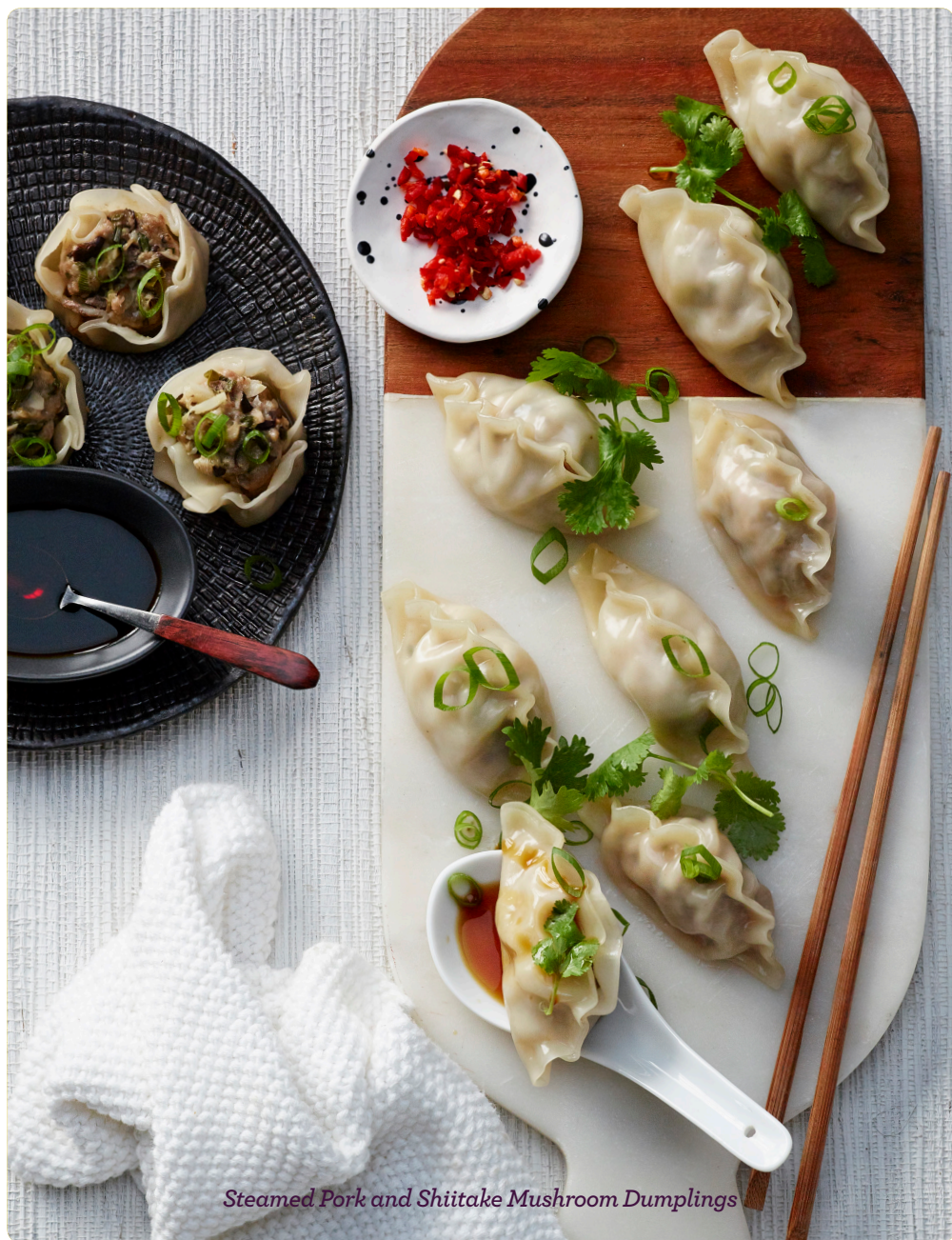
Steamed Pork and Shiitake Mushroom Dumplings