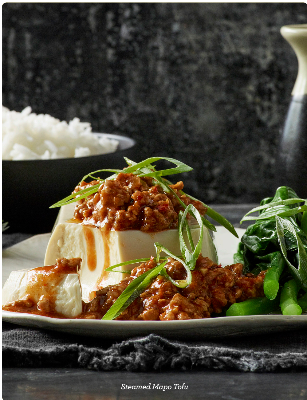
Steamed Mapo Tofu