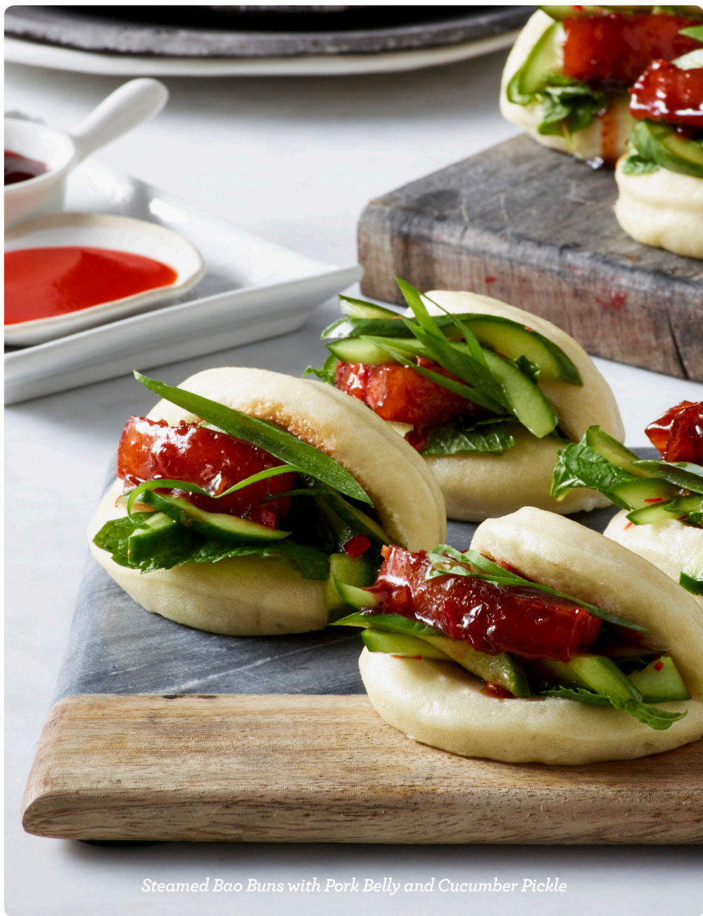
Steamed Bao Buns with Pork Belly and Cucumber Pickle