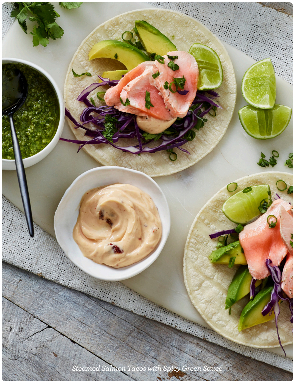
Steamed Salmon Tacos with Spicy Green Sauce