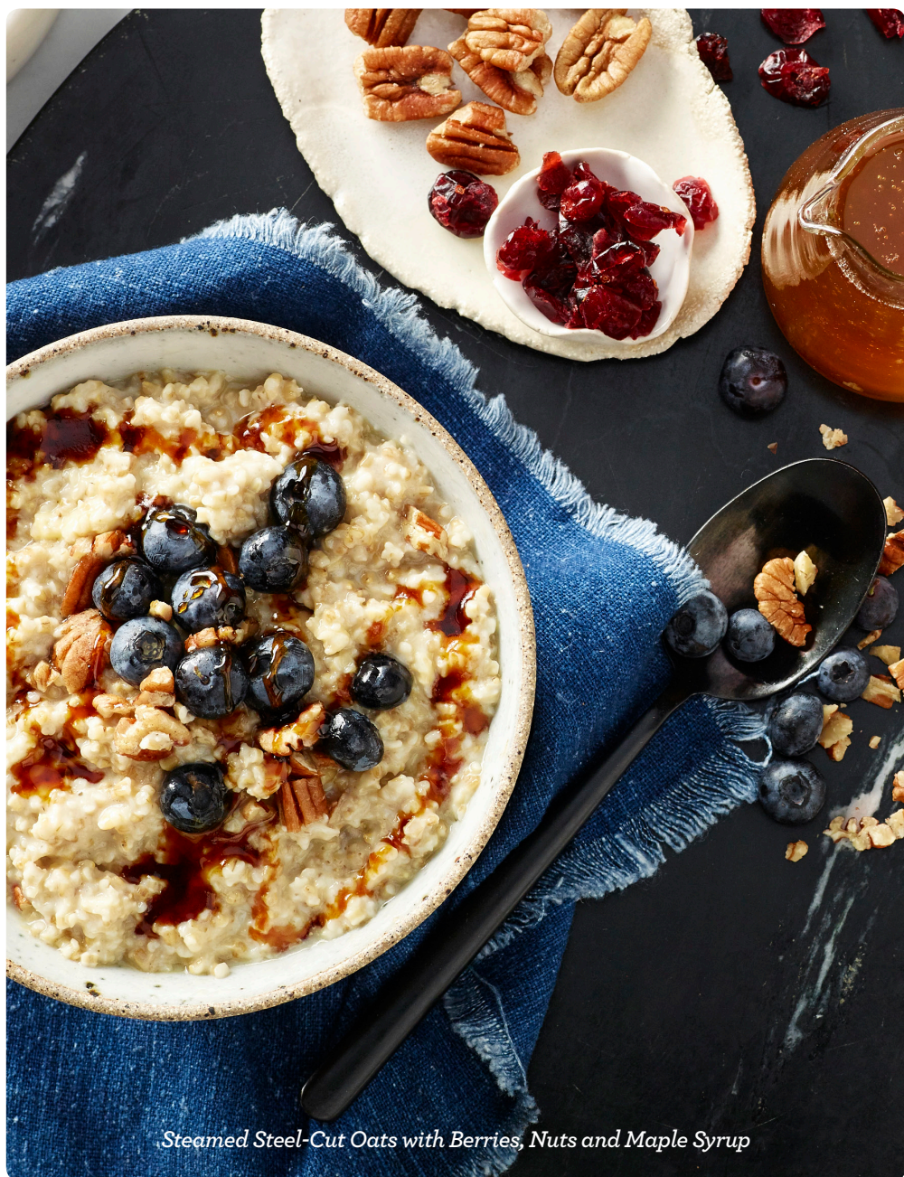
Steamed Steel-Cut Oats with Berries, Nuts and Maple Syrup