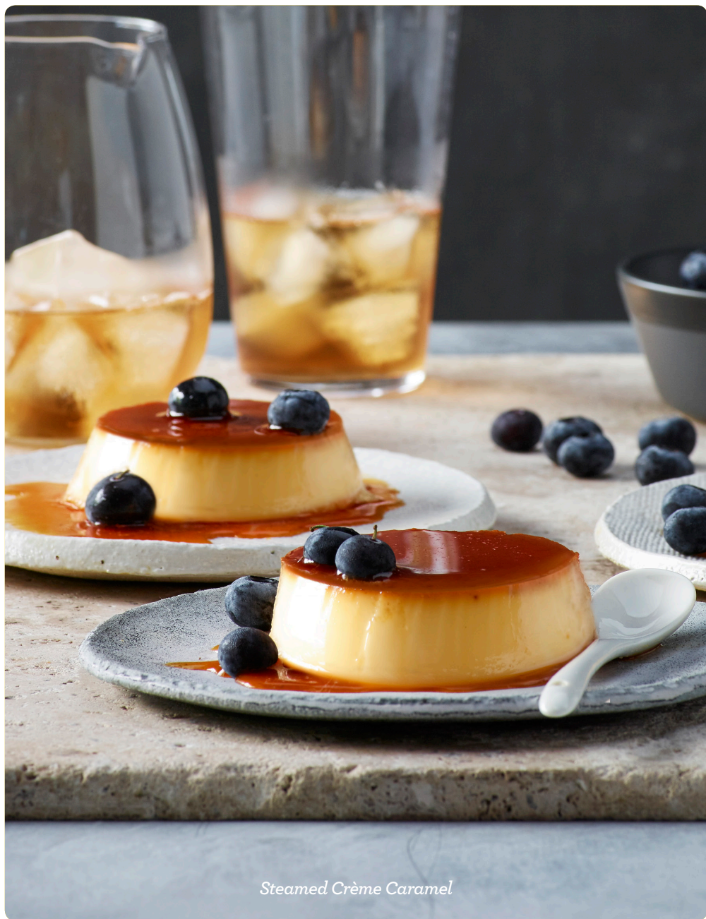
Steamed Crème Caramel