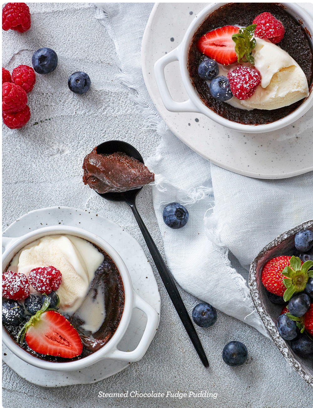
Steamed Chocolate Fudge Pudding