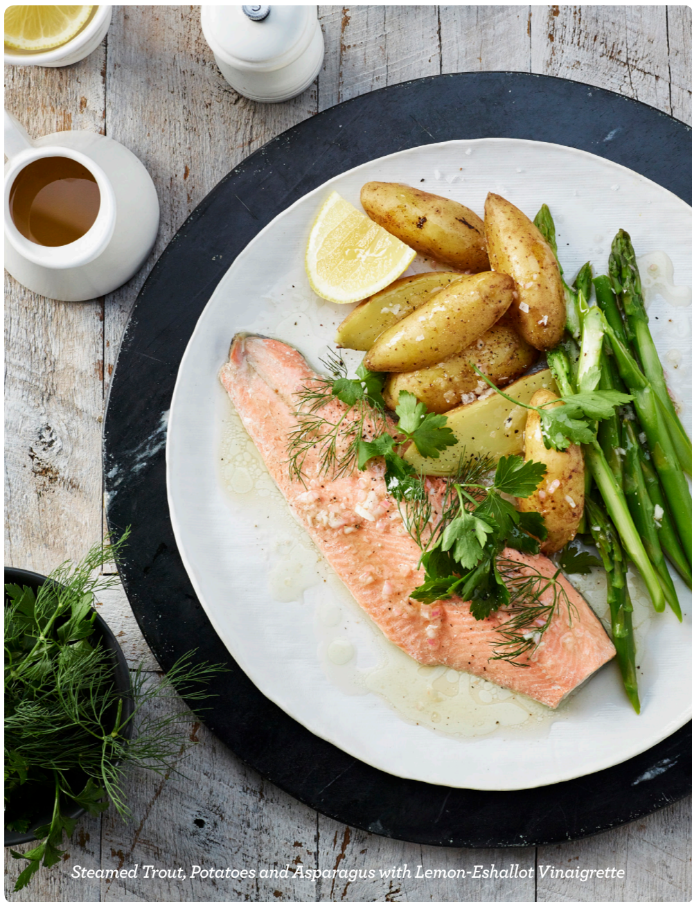
Steamed Trout, Potatoes and Asparagus with Lemon-Eshallot Vinaigrette