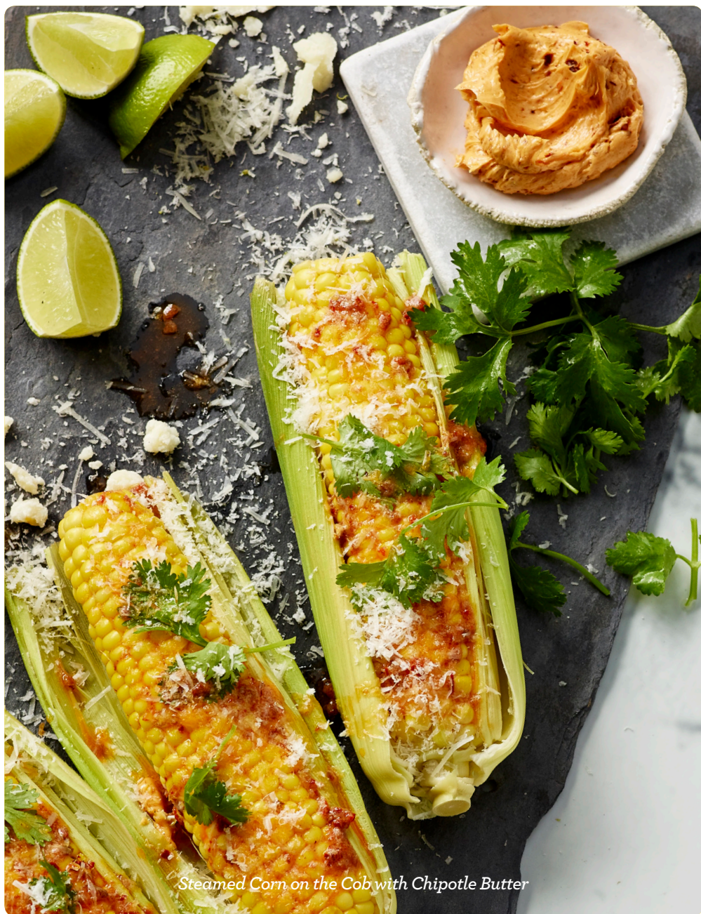
Steamed Corn on the Cob with Chipotle Butter